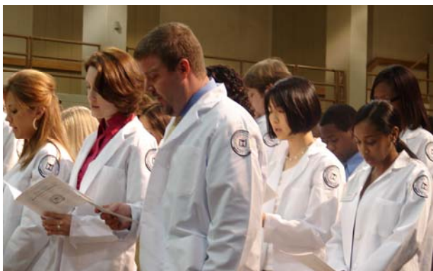
Incoming students recite the Pledge of Professionalism during White Coat Ceremony.

After the ceremony, more than 500 people attended the reception, sponsored by The Kroger Company. Kroger has been the only sponsor of this event since its inception.